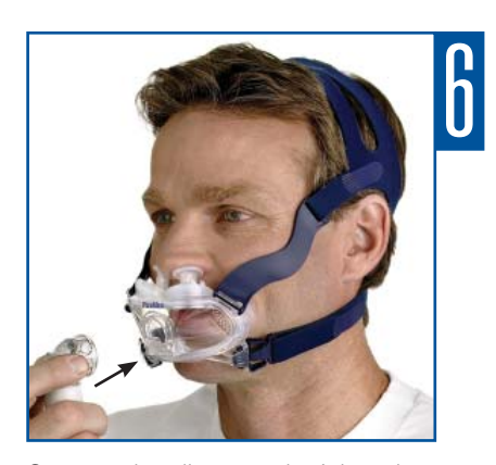
Connect the elbow on the inlet tube to the frame, ensuring it clicks into place.

Rotate the elbow/swivel to ensure it rotates freely on the frame.