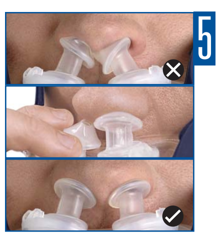
If the pillows are incorrectly positioned at the entrance to the nostrils, readjust them. Press them down into the base and then slowly release, guiding them into position.