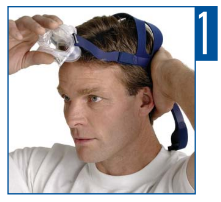
Place the headgear on the head like a cap and pull the mask forward onto the face.

Make sure the headgear fits evenly on the top of the head.