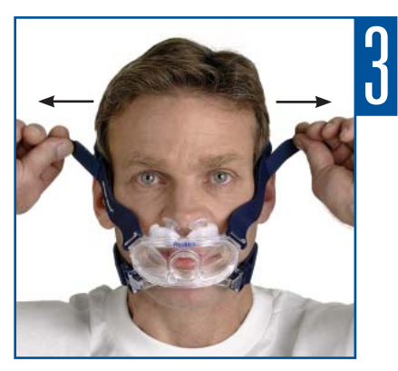
Unfasten the Velcro<sup>™</sup> tabs and pull the upper headgear straps evenly. Do not over tighten the straps.

Fasten the lower headgear clips, ensuring they click into place.