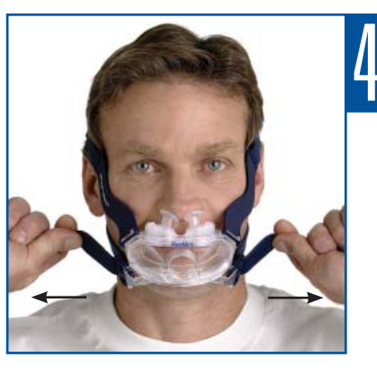
Unfasten the Velcro tabs and pull the lower headgear straps evenly.

Alternate adjustment of upper and lower straps until a comfortable and even fit is obtained.