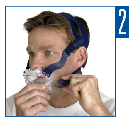
Insert the pillows so that they sit gently at the entrance to the nostrils.

Make sure the headgear fits evenly on the top of the head.